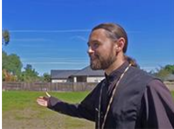
Growing the Mission

OCCIF supports the growth of the Orthodox Church through capital improvement financing to parishes, missions, and monastic communities in the United States. At OCCIF, we bring together decades of professional expertise in the areas of real estate, financing, banking and construction related services to provide the best counsel and oversight for all loan applications.