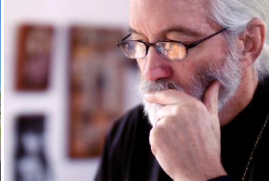
Investing In OCCIF