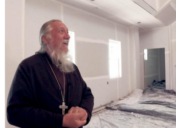
Expanding the Church