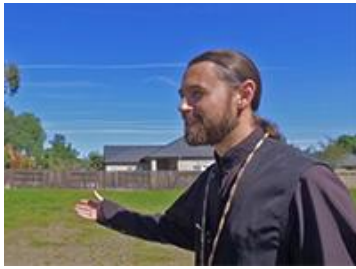
Growing the Mission

provide the best counsel and oversight for all loan applications.