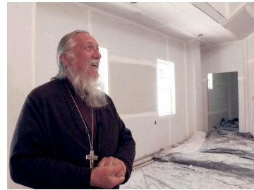
Expanding the Church