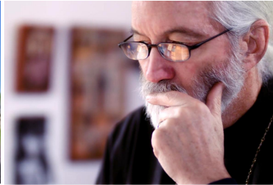
Investing In OCCIF