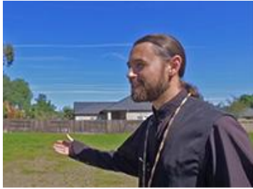
Growing the Mission

OCCIF supports the growth of the Orthodox Church through capital improvement financing to parishes, missions, and monastic communities in the United States. At OCCIF, we bring together decades of professional expertise in the areas of real estate, financing, banking and construction related services to provide the best counsel and oversight for all loan applications.