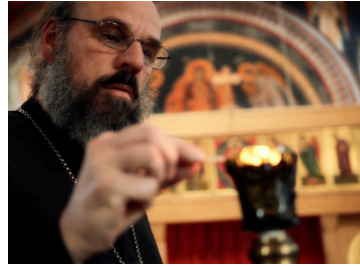
Expanding the Church