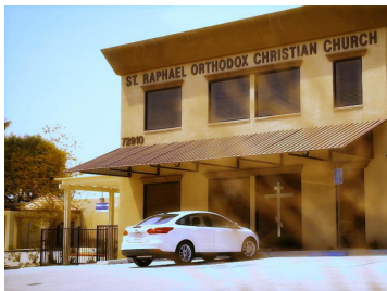
Finding A New Home

OCCIF supports the growth of the Orthodox Church through capital improvement financing to parishes, missions, and monastic communities in the United States. At OCCIF, we bring together decades of professional expertise in the areas of real estate, financing, banking and construction related services to provide the best council and oversight for all loan applications.