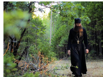
Supporting the Monastery