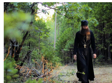
Supporting the Monastery