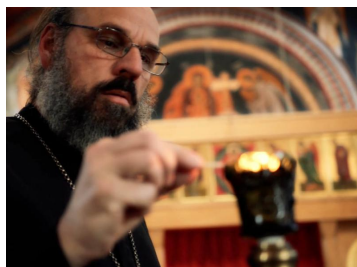
Expanding the Church